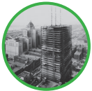
Toronto Dominion Tower rises in front of the Royal York Hotel as seen in September 1965 TD Bank Group Archives P10-0080 Panda & Associates 64603-44