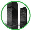
Aerial view, Toronto Dominion Centre, ca. 1969 77-252-8 16756-M73