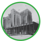
Banking Pavilion under Construction, Toronto Dominion Centre, August 1967