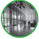
TD Tower Lobby Interior, Toronto Dominion Centre, 1970 TD Bank Group Archives 77-257-9