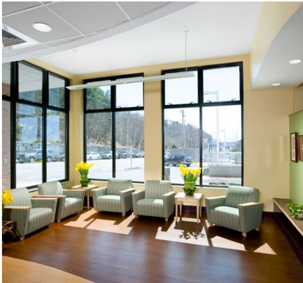
Avesta Housing - Florence House

Since 2006, TDCF has awarded 525 Housing for Everyone grants and more than $42 million to support a critical human need: affordable housing. Here are a few project highlights: