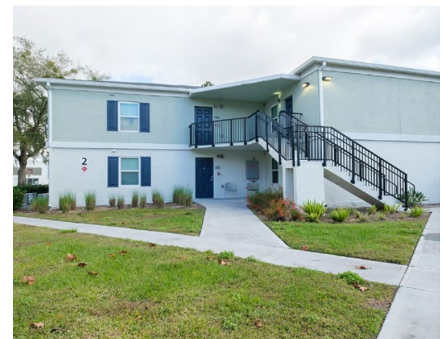
Ability Housing - Wayne Densch

Funded in 2019, Ability Housing’s Wayne Densch Project , based in Florida, renovated and expanded apartment units for low- or very low-income households, bringing the total to 75 units to house 127 people, including children, seniors, military veterans, people living with disabilities and formerly homeless people.